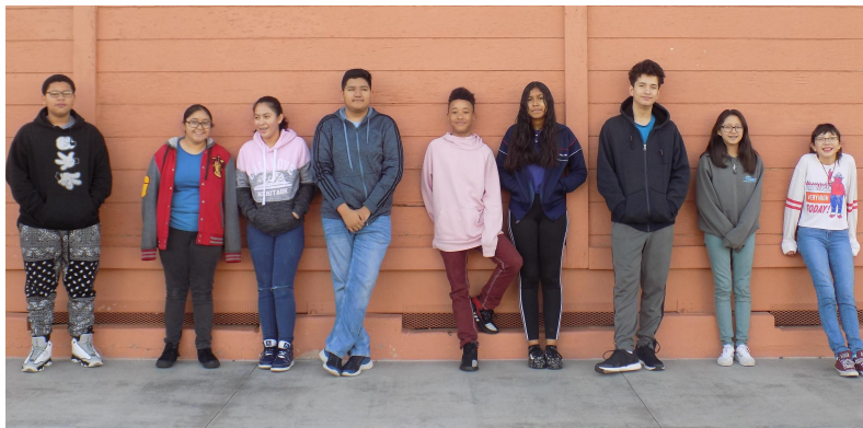
8th Grade students who went on the GATE field trip on December 21st in 2018