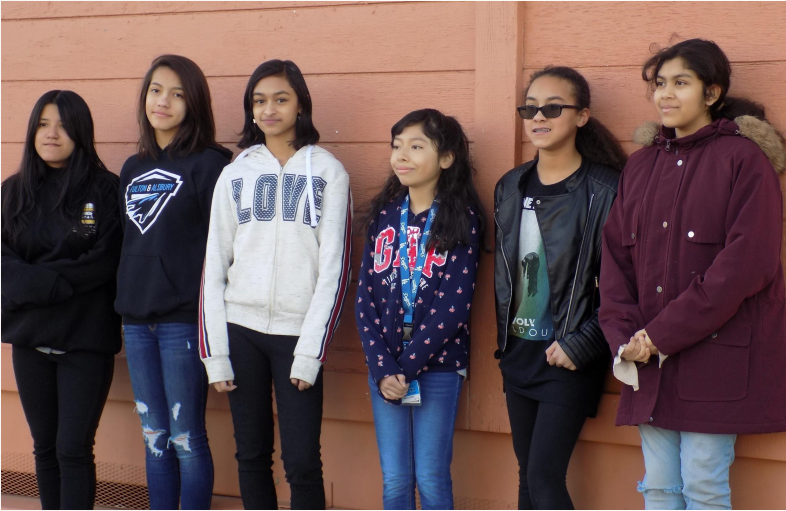
7th Grade students who went on the GATE field trip on December 21st in 2018

The entire seventh grade had went on a field trip to The Moah Art Museum and LPAC on the BLVD to watch a play called "How To Survive Middle School". Along with those two trips, there is an optional trip to Seaworld happening later on!